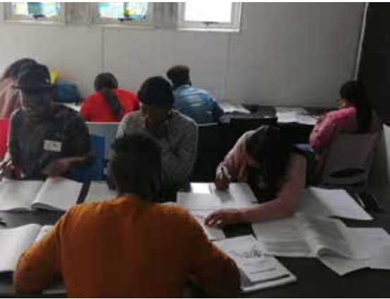
Some of the youth that is part of the EPWP and George Municipality Youth Peer Educator programme during their mobile literacy training at the George Youth Café.

Another 60 EPWP workers received non-accredited food garden training from the Department of Agriculture in November 2020. The topics included food safety, agriculture marketing, soil preparation and plant nutrition. The training took place at the George Municipality Worker's Collection Point(Industrial Road, next to Coca Cola and Tekkie Town)and Rosemoor and Thembaletu Civic Centres. The training also included Covid-19 protocol in the workplace as well as basic computer training.