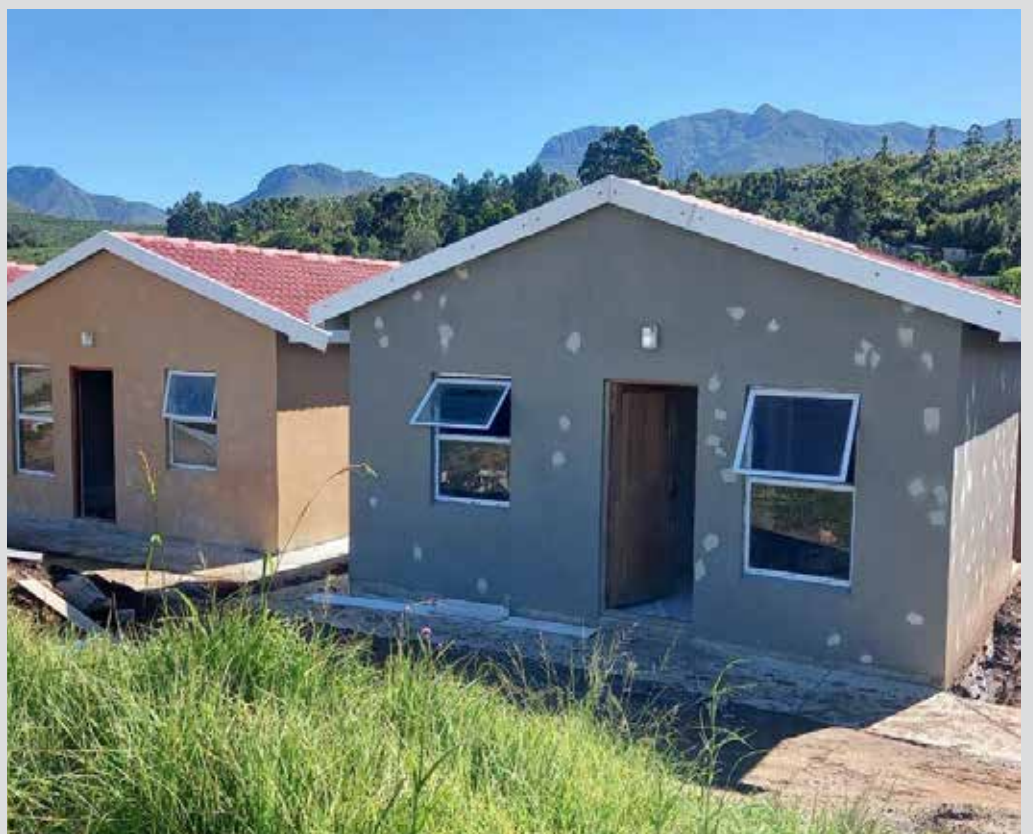
The Golden Valley housing project houses are nearly finished and will soon be handed over to beneficiaries.