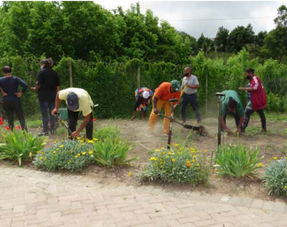
EPWP workers attend the practical agriculture training at the George Municipality Worker's Collection Point.