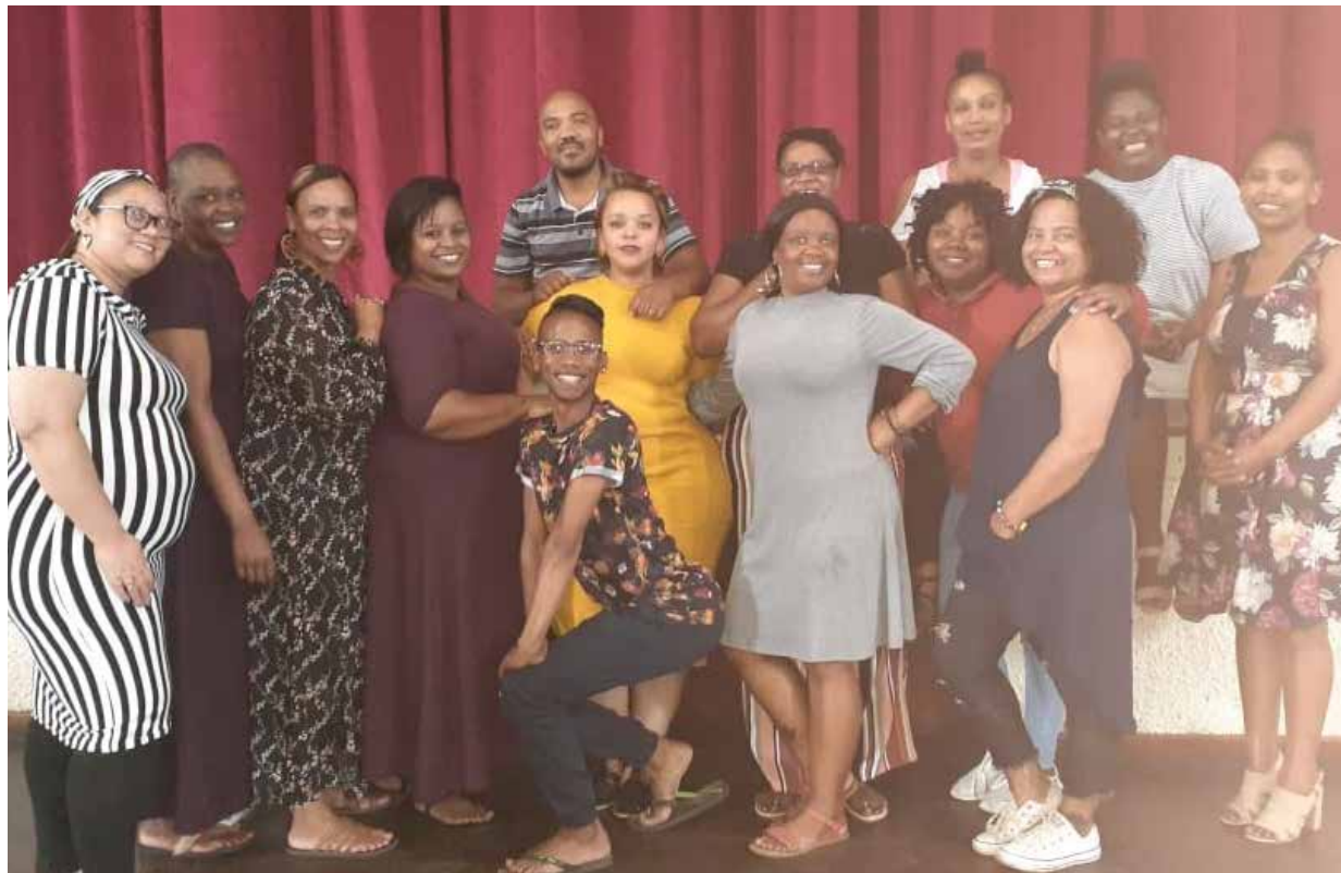
George Library Staff as well as staff of the Seven Passes Initiative and the Mikhulu Child Development Trust at a Book-Sharing Workshop.