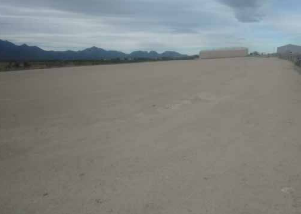
The cleared surface shown in the picture is the area from where the composting plant will be operated from at the Landfill site on the R102 (airport road).

this will be addressed via municipal supply chain management criteria. The public will be allowed at the composting site under strict regulations to deliver green and organic waste only with the operations of the day to day work handled by the appointed company. The highly technical process will have to be run by a specialised service provider. Council will still need to take a decision on what will be done with the final product, but it can be sold and provide revenue. George remains committed to waste reduction, not only because the region is running out of landfill space but also because it is the environmentally right thing to do. Waste management is increasingly expensive, and with local landfill sites closing and transport to regional landfill and waste disposal facilities adding to the bill, if we can reduce the amount of waste transported out of the city, everyone benefits in the long-term – financially and environmentally.