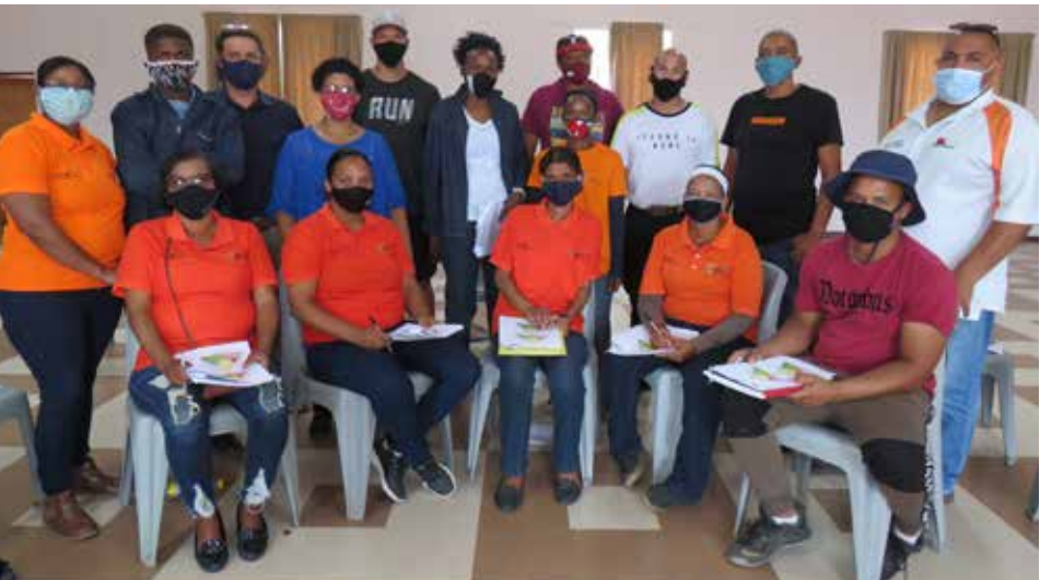
EPWP workers at the theoretical training with their mentors at the Rosemoor Civic Centre.