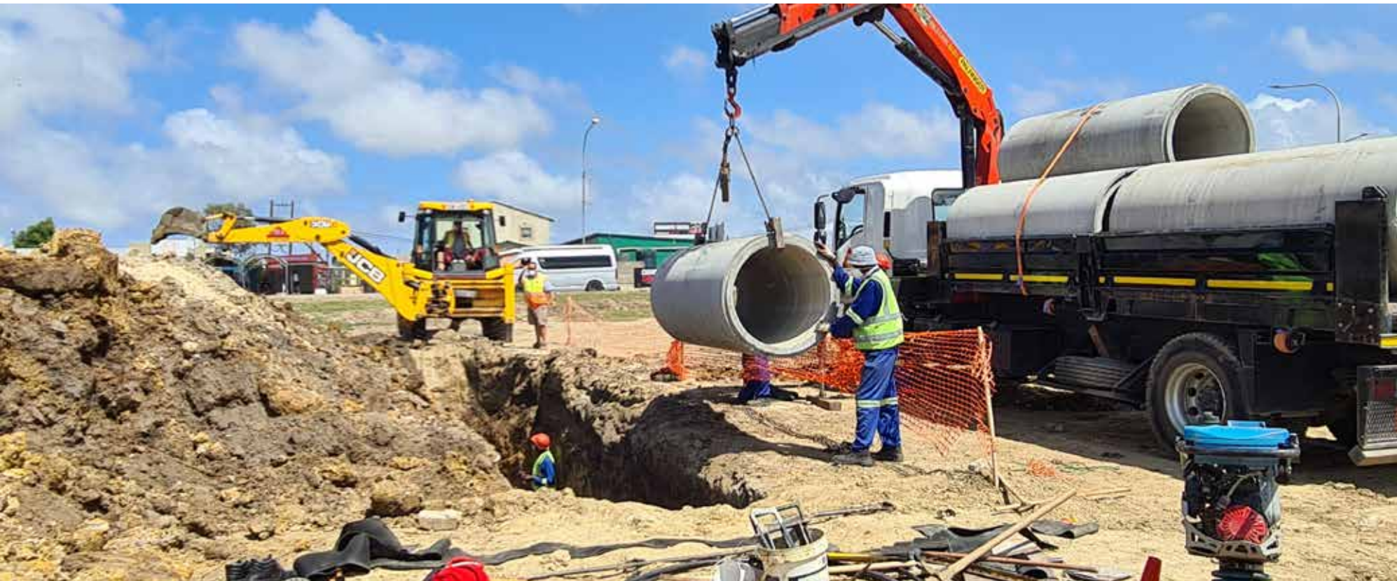
The Thembaletu Zone 9 Stormwater project is one of four currently underway.