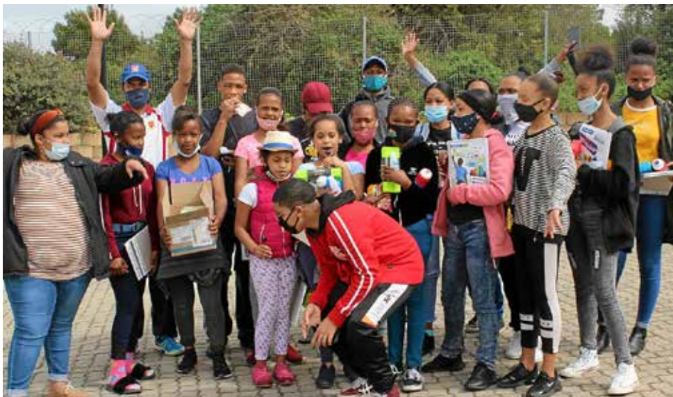
Learners from Pacaltsdorp Primary School after the cleanup.